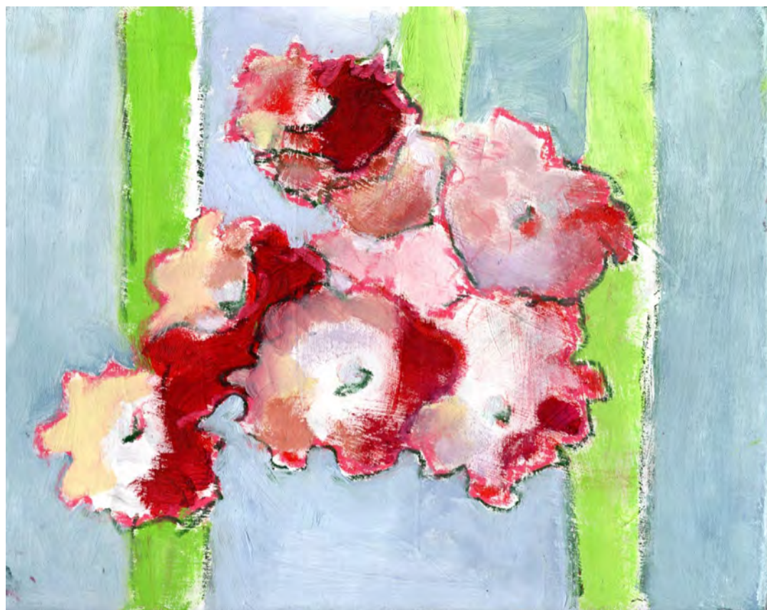
PREVIOUS SPREAD: Yellow Road ABOVE: Decorative Diagram