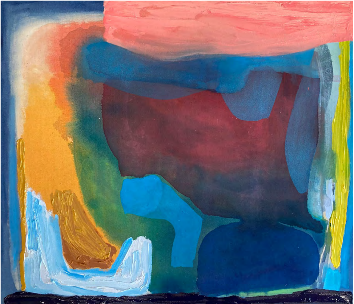
PREVIOUS SPREAD: Overflow ABOVE: Floating and Sinking

I earned a BFA in Visual Communication Design with I am an abstract painter living and working in Two Rivers, Wisconsin. Born and raised in Detroit, I began making art at a young age and was fortunate to attend a high school where I could major in art. I went on to receive my BFA in Painting from the Center for Creative Studies (CCS) in Detroit. I worked as a graphic designer and illustrator in Chicago for many years, but always continued my personal artwork. I am now focused solely on painting, exhibiting, and selling my work.